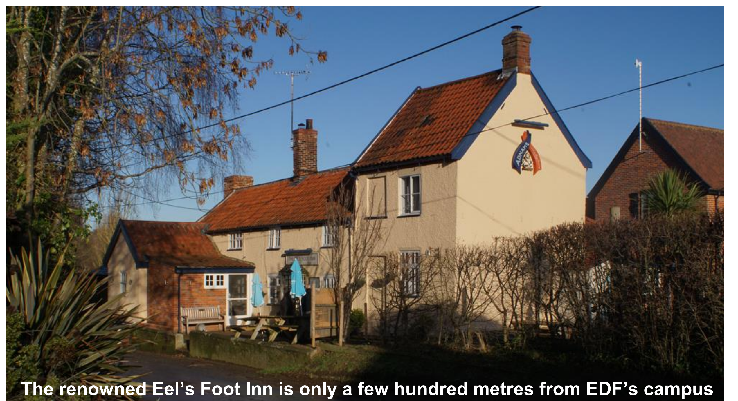
The renowned Eel's Foot Inn is only a few hundred metres from EDF's campus