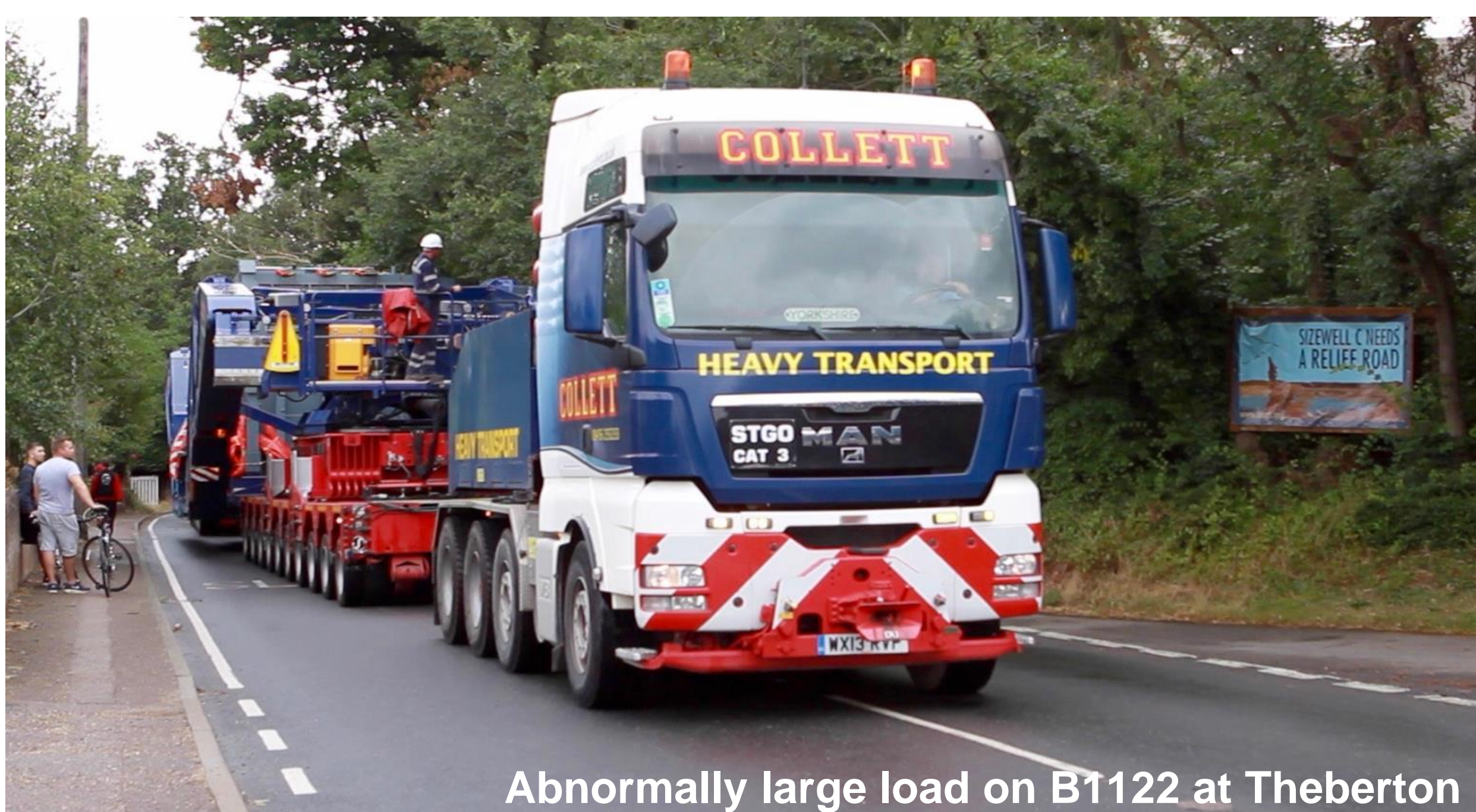
Abnormally large load on B1122 at Theberton