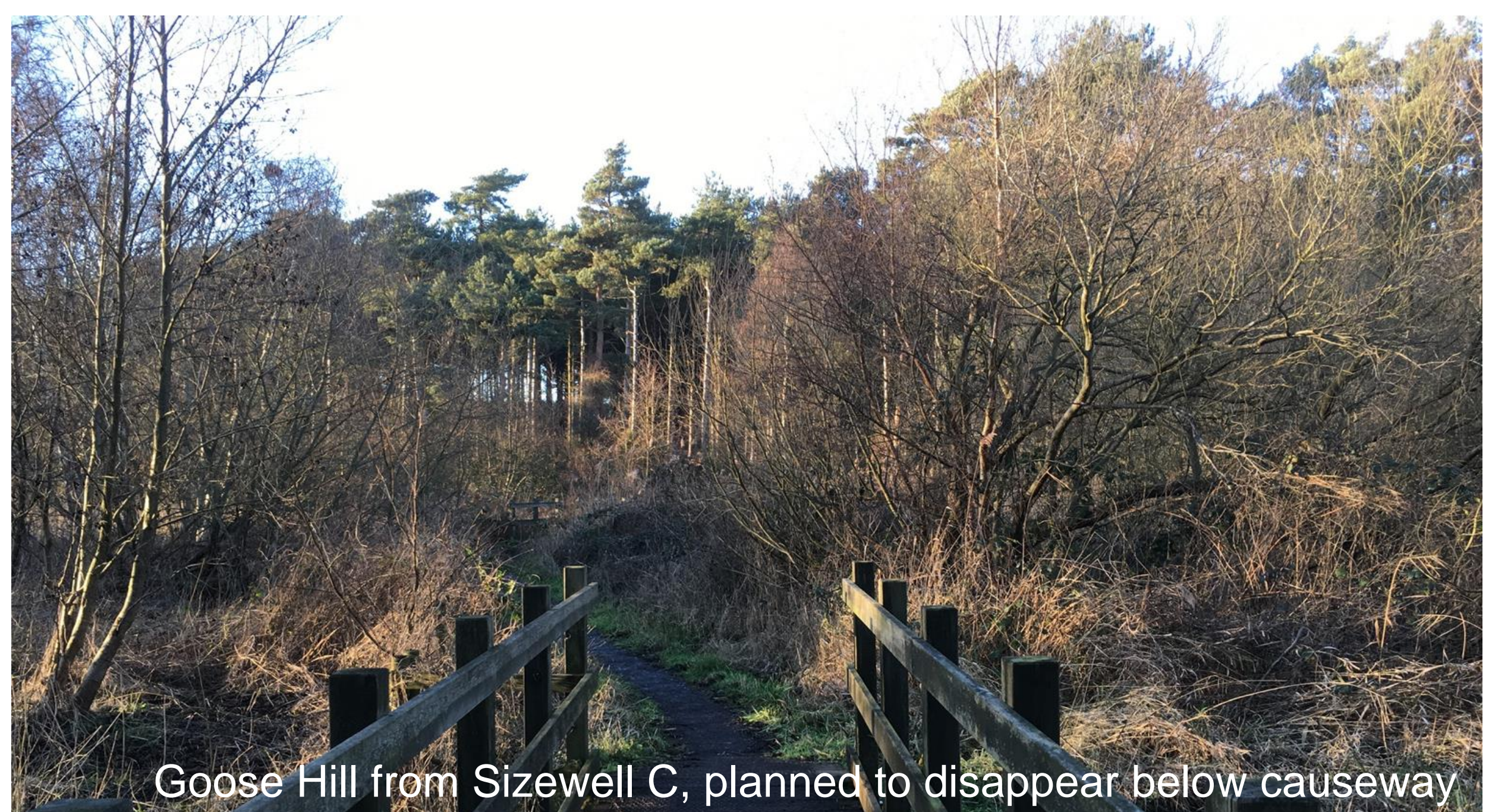
Goose Hill from Sizewell C, planned to disappear below causeway