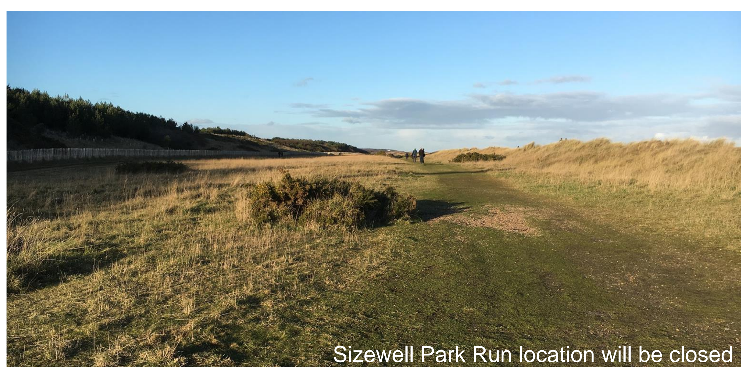
Sizewell Park Run location will be closed

EDF must address these problems for the community