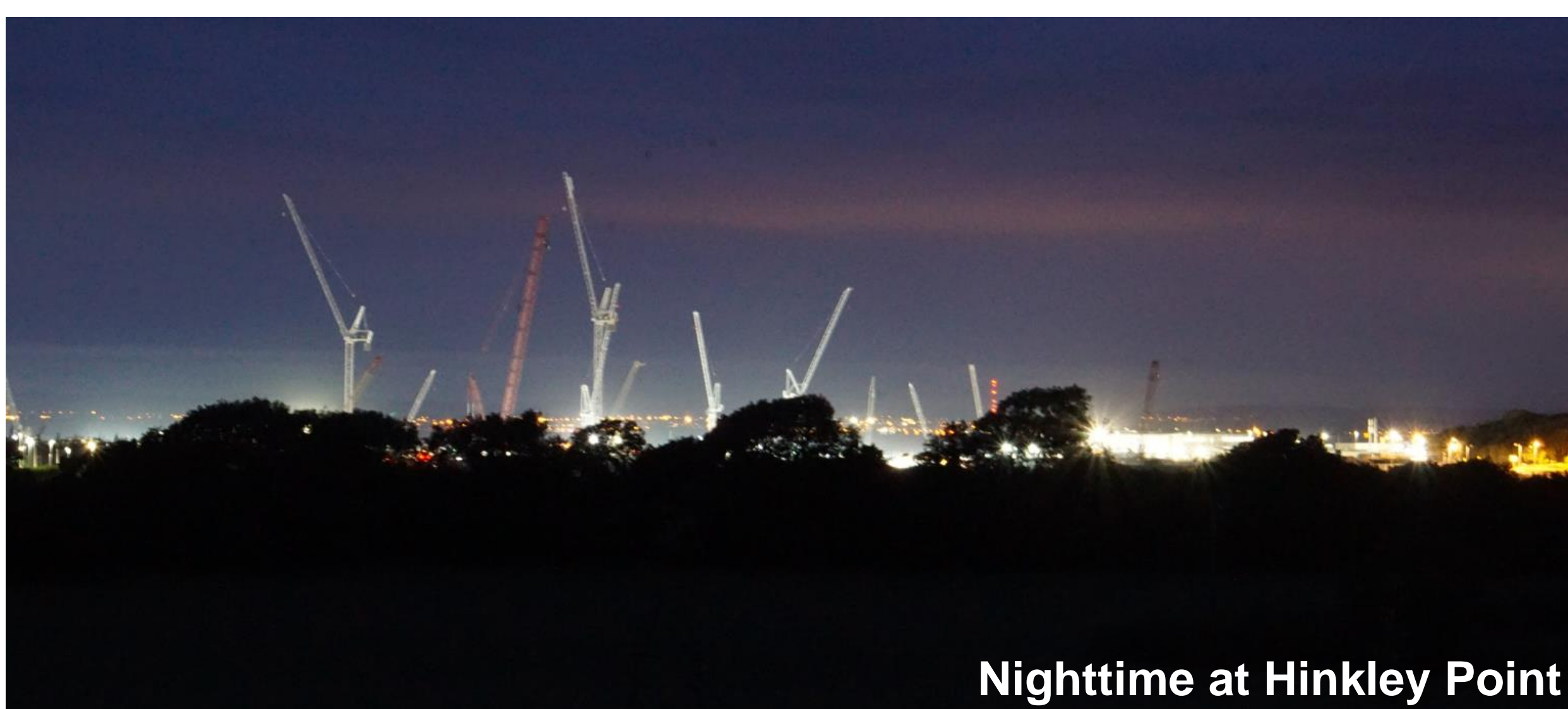
Nighttime at Hinkley Point