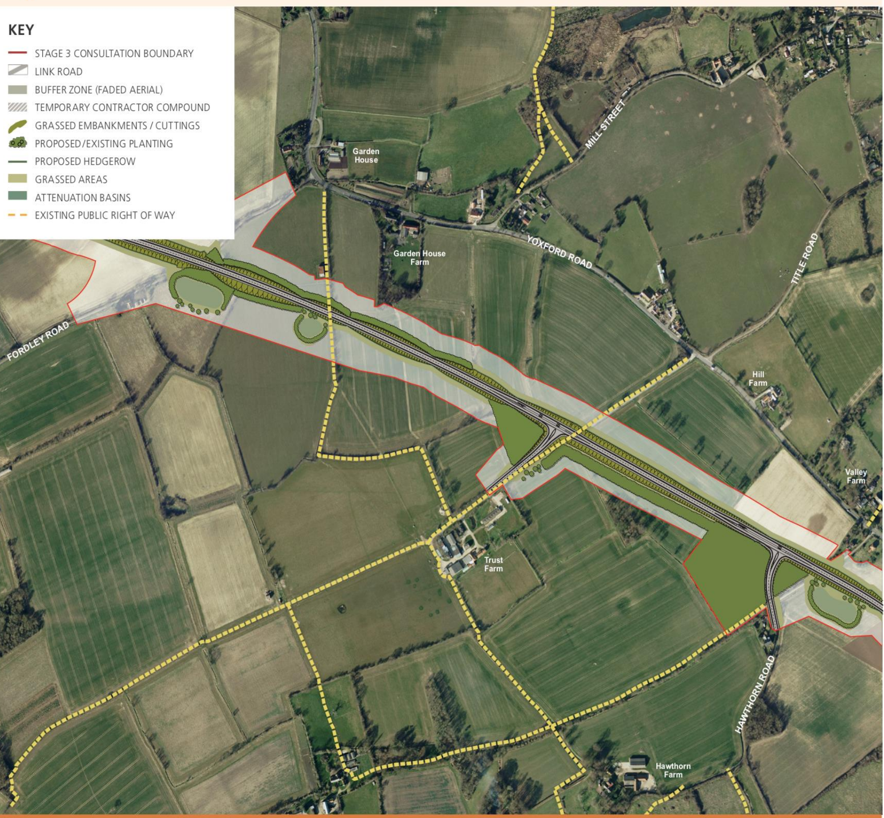
Figure 10.5 Sizewell link road masterplan - Area 3