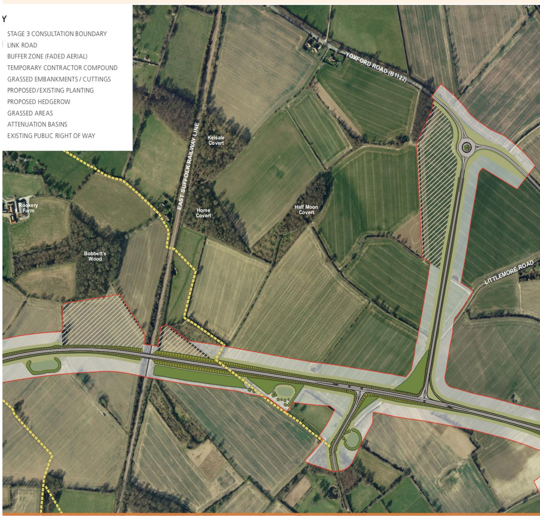
Figure 10.4 Sizewell link road masterplan - Area 2