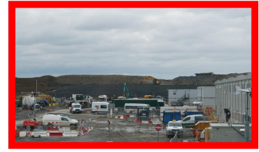
23 hectares of spoil and gravel heaps up to 30 metres high, the same height as the tower at Cathedral at Bury St Edmunds