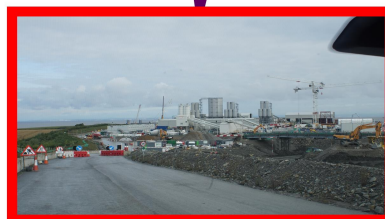
92 hectares of forest and agricultural land used to create the construction compound and laydown areas