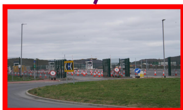
20 hectare HGV reception and security area with parking space for 1000 cars and buses