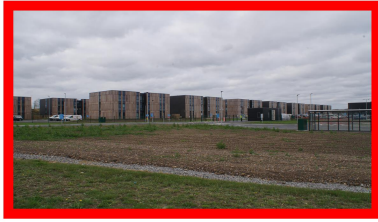
A campus for 2,400 workers with 3 and 4 storey buildings, 5 TIMES THE SIZE of the above 3 storey development at Hinkley