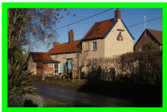
Eel's Foot Inn