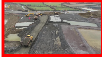
Up to 20 hectares of deep quarry excavations to extract sand/gravel then bury peat and other unusable materials just 260 metres from Eastbridge!